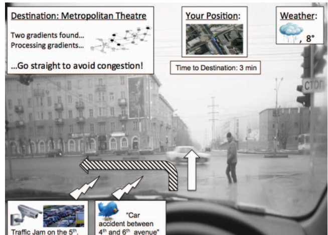
Figure 3: Steering a car towards a point of interest.

One distinct benefit of this implementation approach is that an environment model can be built upon and interlink with existing ontology-based domain knowledge through the principles of Linked Data [2]. Not only does this allow for the adoption of emerging vocabulary standards, for